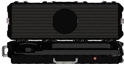
Rugged STORM® case with custom-fit foam case for easy storage and quick removal