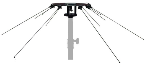
Ground plane disk and radials are powder coated steel with nickel plated brass threads