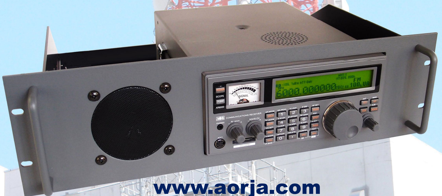
Photo of receiver with rack option HRE5001